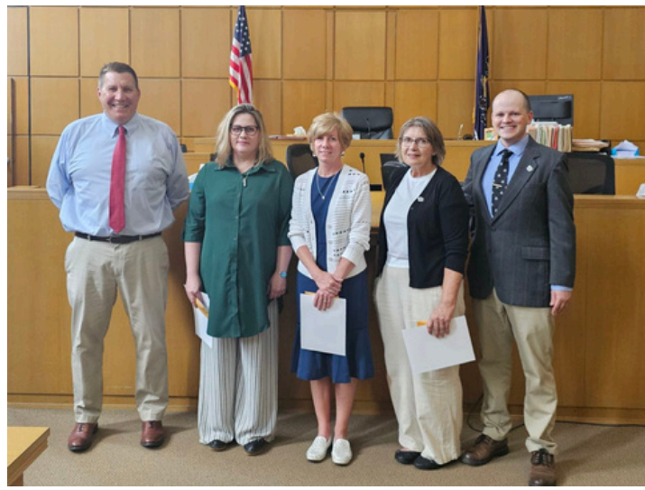
Spring 2024 Lebanon Training Class at their Swearing In Ceremony

"I have worked with several families with children with special needs. These parents were overwhelmed by these needs and needed help to obtain and navigate needed educational and behavioral health services for their children. Working together with caseworkers, we were able to secure these essential services and equip the parents with what was needed for their children. It was highly meaningful work to help these children that were in foster care return home to their parents with the resources needed for their future care. I cannot think of more meaningful volunteer work. Truly you can change the life of a vulnerable child. It is a compassionate outreach to families in crisis and at-risk children." – CASA Kathy N.