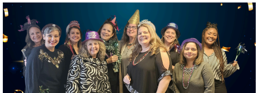
CASA Staff 2024 Holiday Card Photo