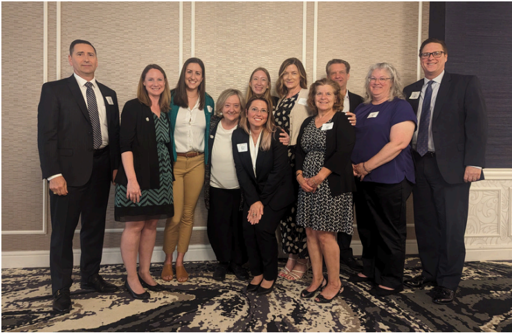
Spring 2024 Training Class at their Swearing In Ceremony