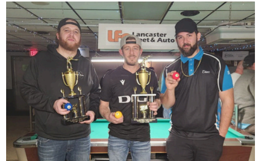
HHJB Charity 8 Ball Tournament Winners