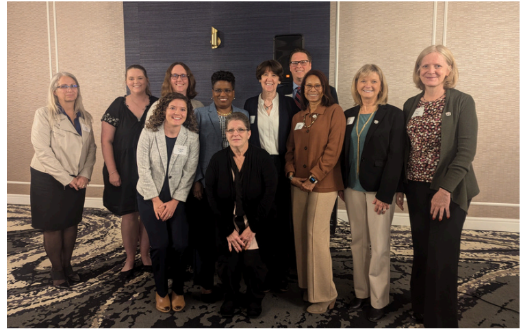
Fall 2024 Training Class at their Swearing In Ceremony