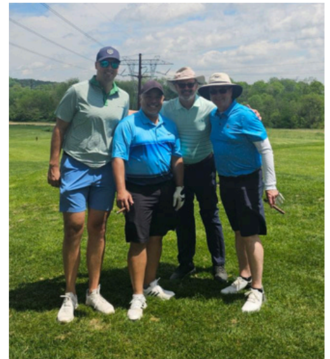
Golfers at Fidevia's Voices for Hope Golf Classic in May 2024